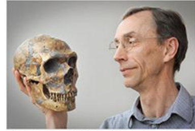
Svante Pääbo holds the skull of a Neanderthal

Using cutting-edge DNA isolation and sequencing techniques, Svante Pääbo, Ph.D., has contributed to the understanding of human evolution by analyzing the genomes of our ancestors. Dr. Pääbo recently made presentations at both the NIH and the Smithsonian Institution about his work. His research has shown that Neanderthals interbred with modern humans 50-80 thousand years ago. His genome sequencing efforts have also demonstrated that a set of ancient bones came from a previously unknown species of hominid, now called Denisovans. To view his NIH talk entitled "Archaic Genomics," see youtube.com/watch?v=M7VdRKQuAa8 . To view his talk at the Smithsonian National Museum of Natural History entitled "Finding Our Inner Neanderthal," see youtube.com/watch?v=zL_d7b1bsUE .