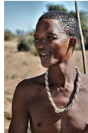
San man from Namibia