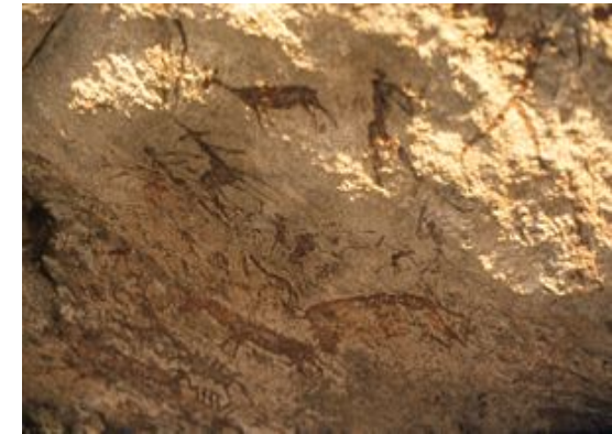
1000 – 2000 years old San-paintings near Murewa ( Zimbabwe )