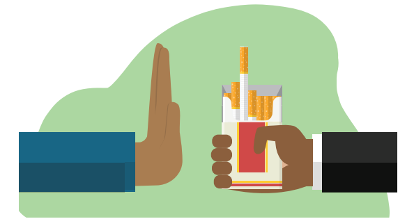
Quit smoking or don't start:

• Your risk of heart disease drops by 50% a year after you quit smoking.